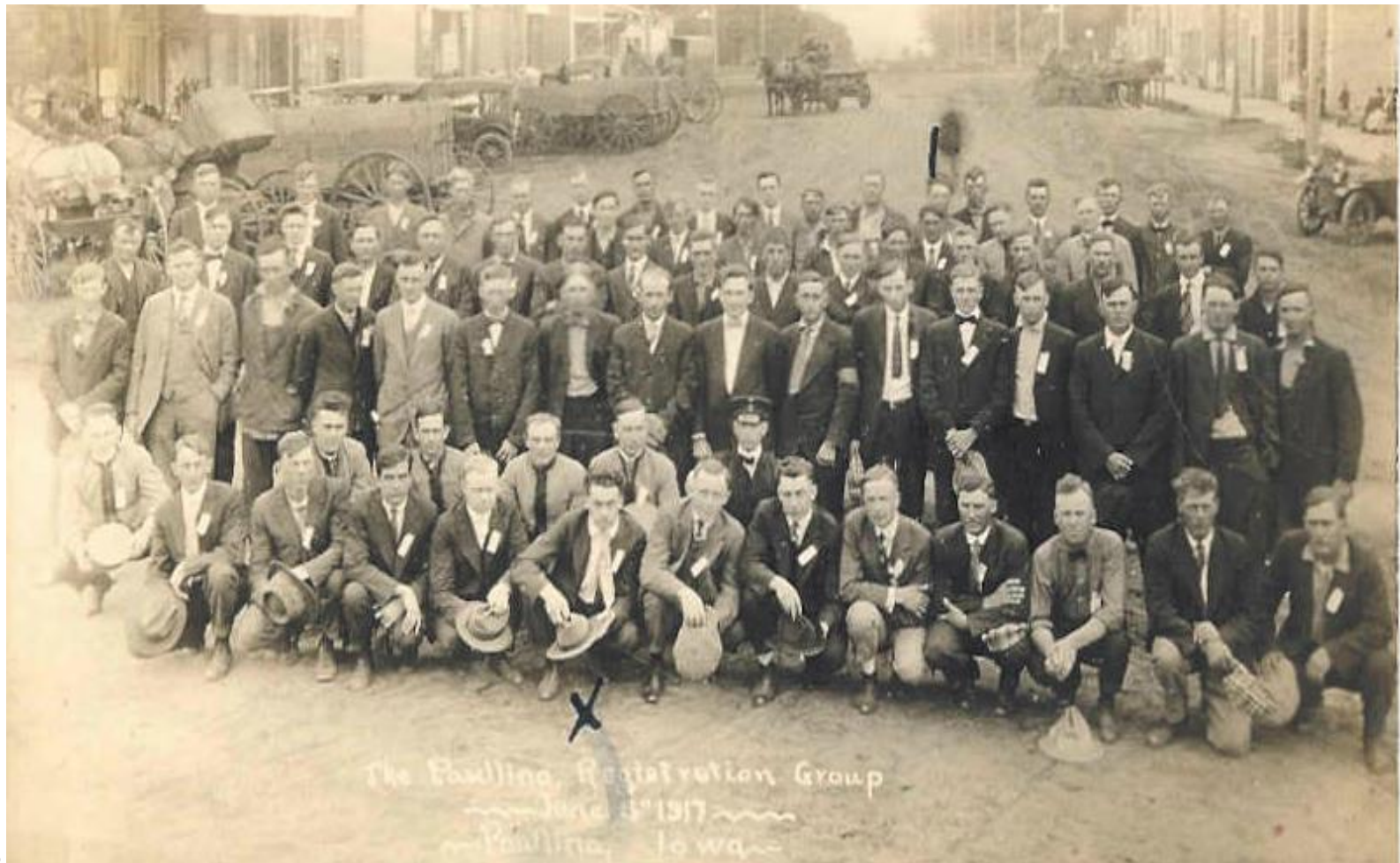
The Bowling Registration Group June 4, 1917 Paulding, Iowa